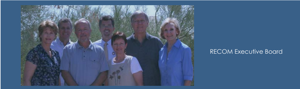
RECOM Executive Board